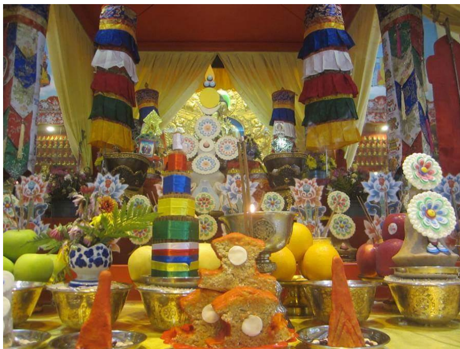
400 Offerings Gya-Shi Puja

🙏功德：经典及密续皆有讲述修持四百供养者将增长其寿命及功德，并可净化烦恼和痛苦。当有人患有重病，做恶梦，凶兆显现或遇不幸事故及通过预测得知将有凶兆时，即修此法以平息灾祸。