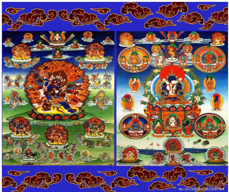
100 Peaceful and Wrathful Deities

In Tibet, Padmasambhawa conferred the teaching of the 100 Deities to his 25 disciples. During that time, there was an evil minister by the name of Shata. He killed many innocent people and also caused a lot of obstacles to prevent the consort of Padmasambhawa, Yeshe Tsogyal from practising the Dharma.